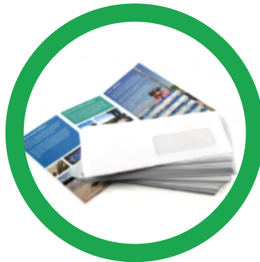
ENVELOPES, PAPERS & MAGAZINES