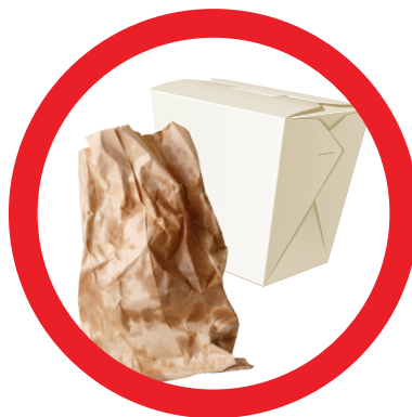
DISPOSABLE FOOD PACKAGING