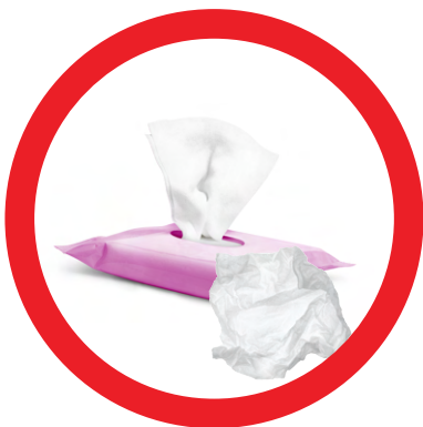
TISSUE PAPER & WET WIPES